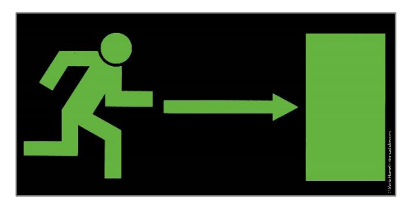
Mara® Glow GW 760

Due to the geometry of the pigment, the best possible glow-in-the-dark effect in screen printing will be achieved using a very coarse mesh. Since the opacity of the pigments is rather low, they will only be effective on white substrates. For more details, please read our separate TechINFO "Phosphorescent Inks".