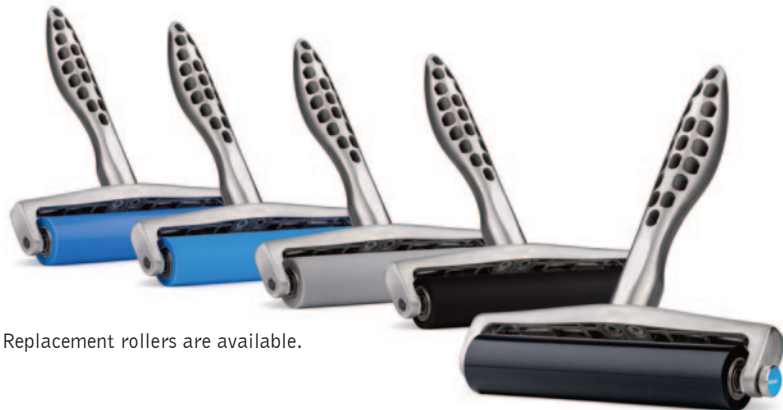
Replacement rollers are available.

p panelclean t utfclean n nanoclean nt ntclean g gntclean